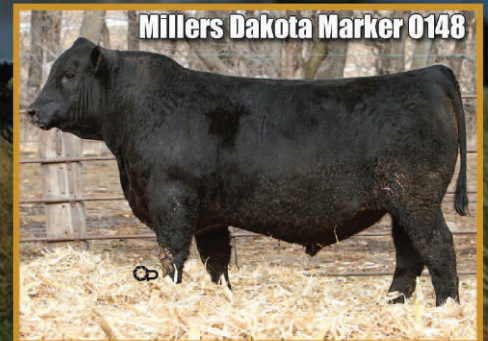
Miller's Dakota Marker 0148