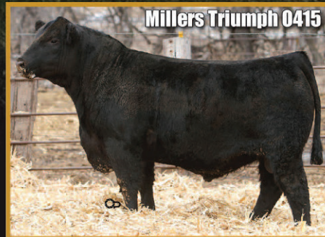
Miller's Triumph 0415