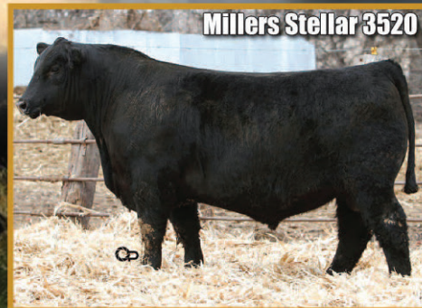
Miller's Stellar 3520