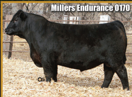
Miller's Endurance 0170