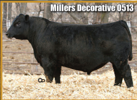
Miller's Decorative 0513

Monday, MARCH 28 2022 1:00 PM Glacial Lakes Livestock - Watertown, SD